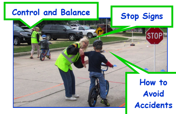
Students from Oelwein Community School District enjoy a skills test during their Bike Rodeo.

Bike Rodeos teach children real-world biking survival skills necessary to ride smart and ride safely!