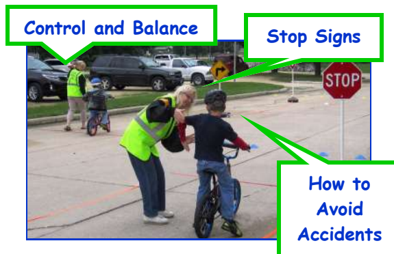
Students from Oelwein Community School District enjoy a skills test during their Bike Rodeo.

Bike Rodeos teach children real-world biking survival skills necessary to ride smart and ride safely!